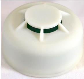
RF-ROR – Wireless Rate of Rise Heat Detector